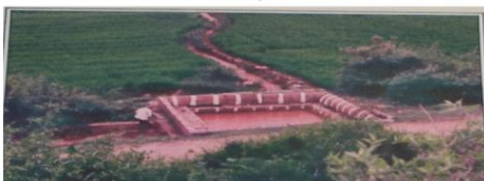
• Irrigation water from Kamalapur tank