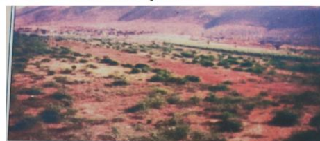
Fig2: Siltation in Daroji kere